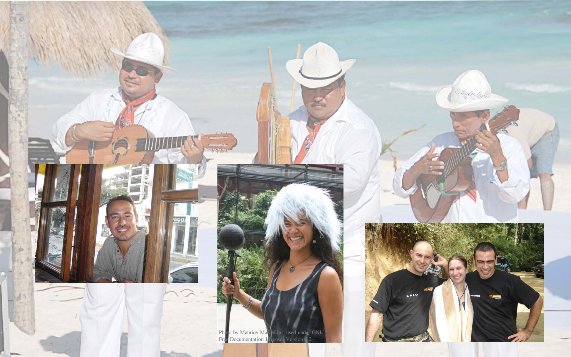
Photo by Maurice Macellin; used under GNU Free Documentation License, Version 1.2